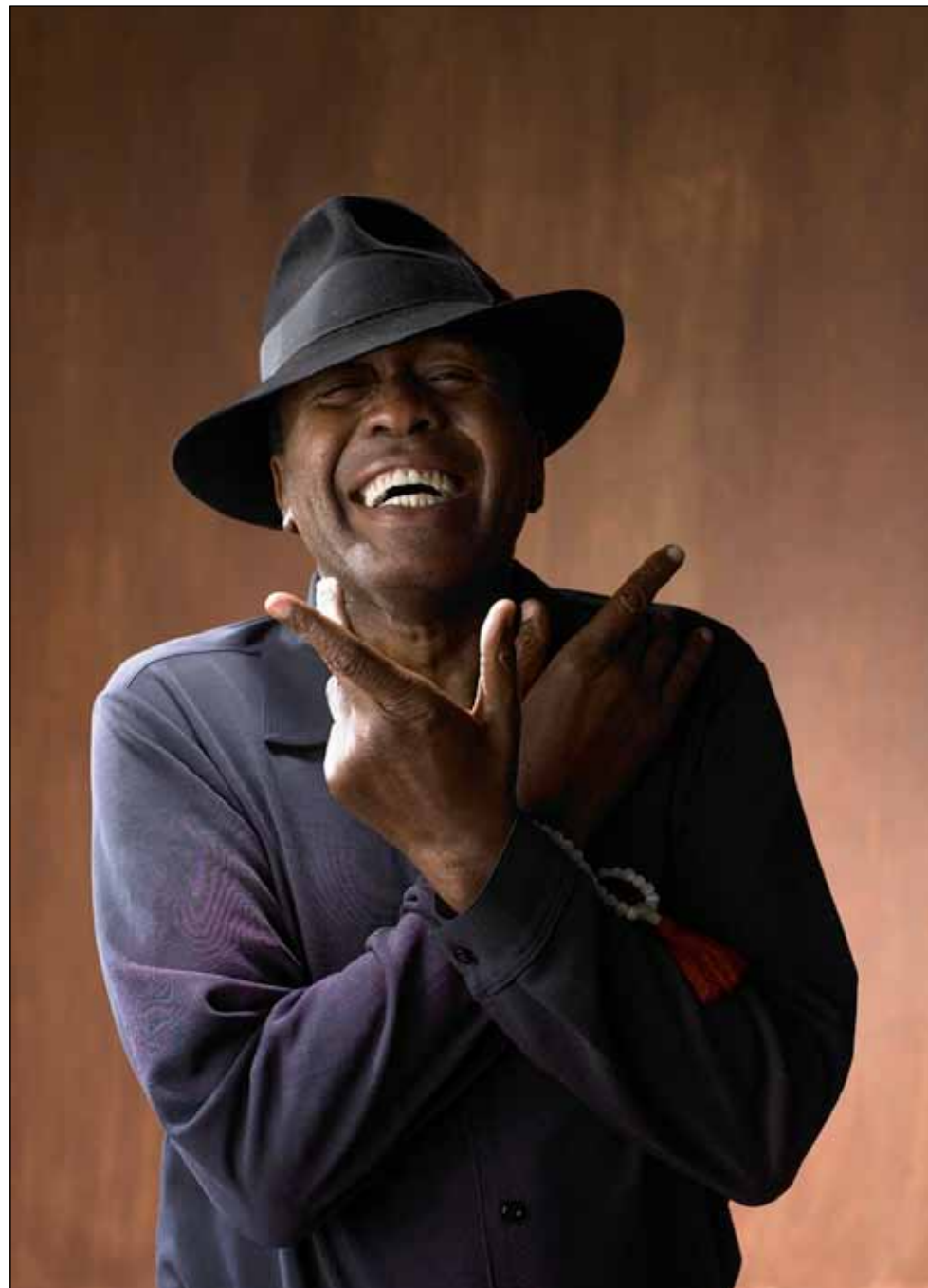
'AN EVENING WITH BEN VEREEN'

Legendary performer Ben Vereen will share his tales and talents when he comes to Carmel March 7